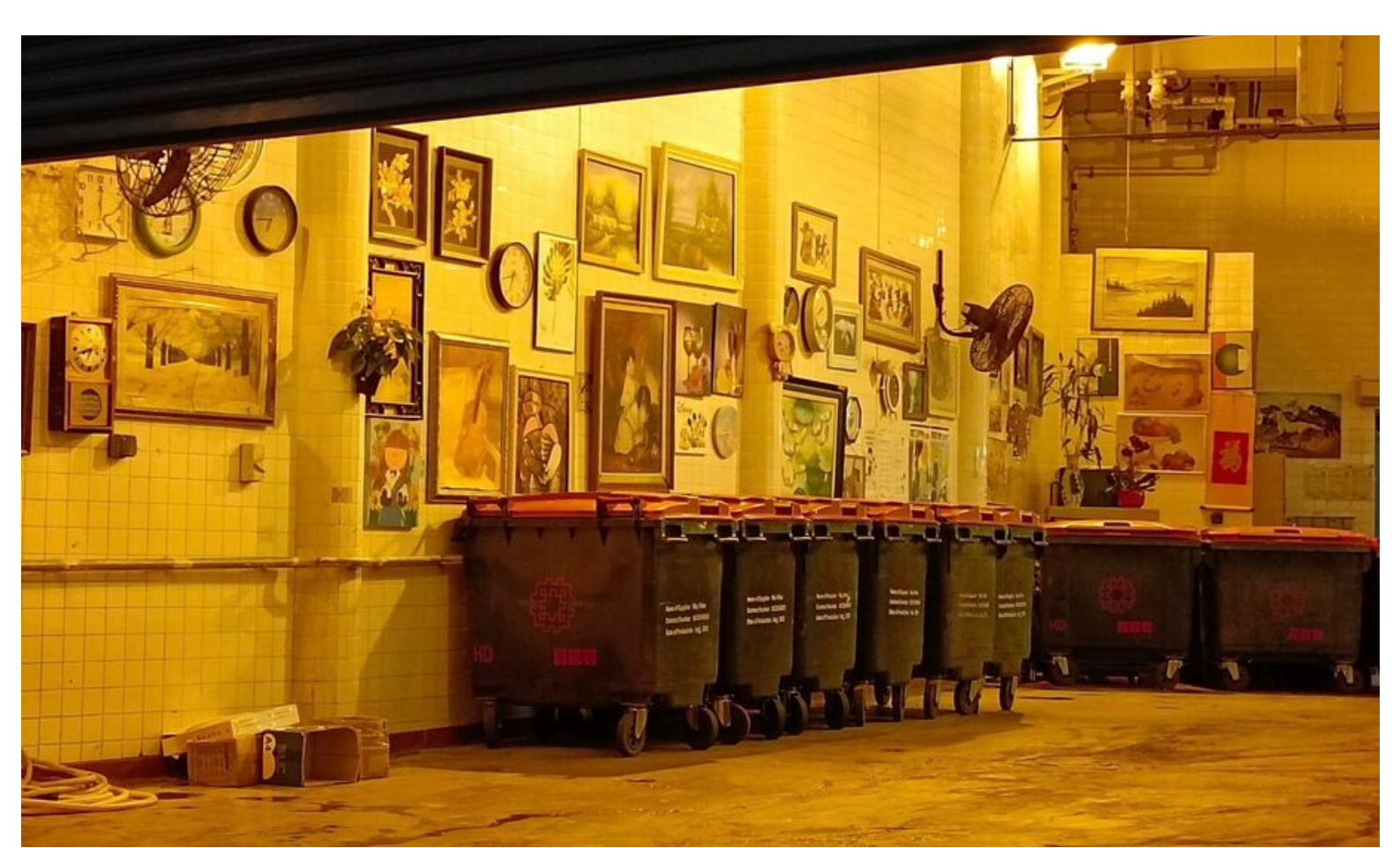
MAR 13, 2023