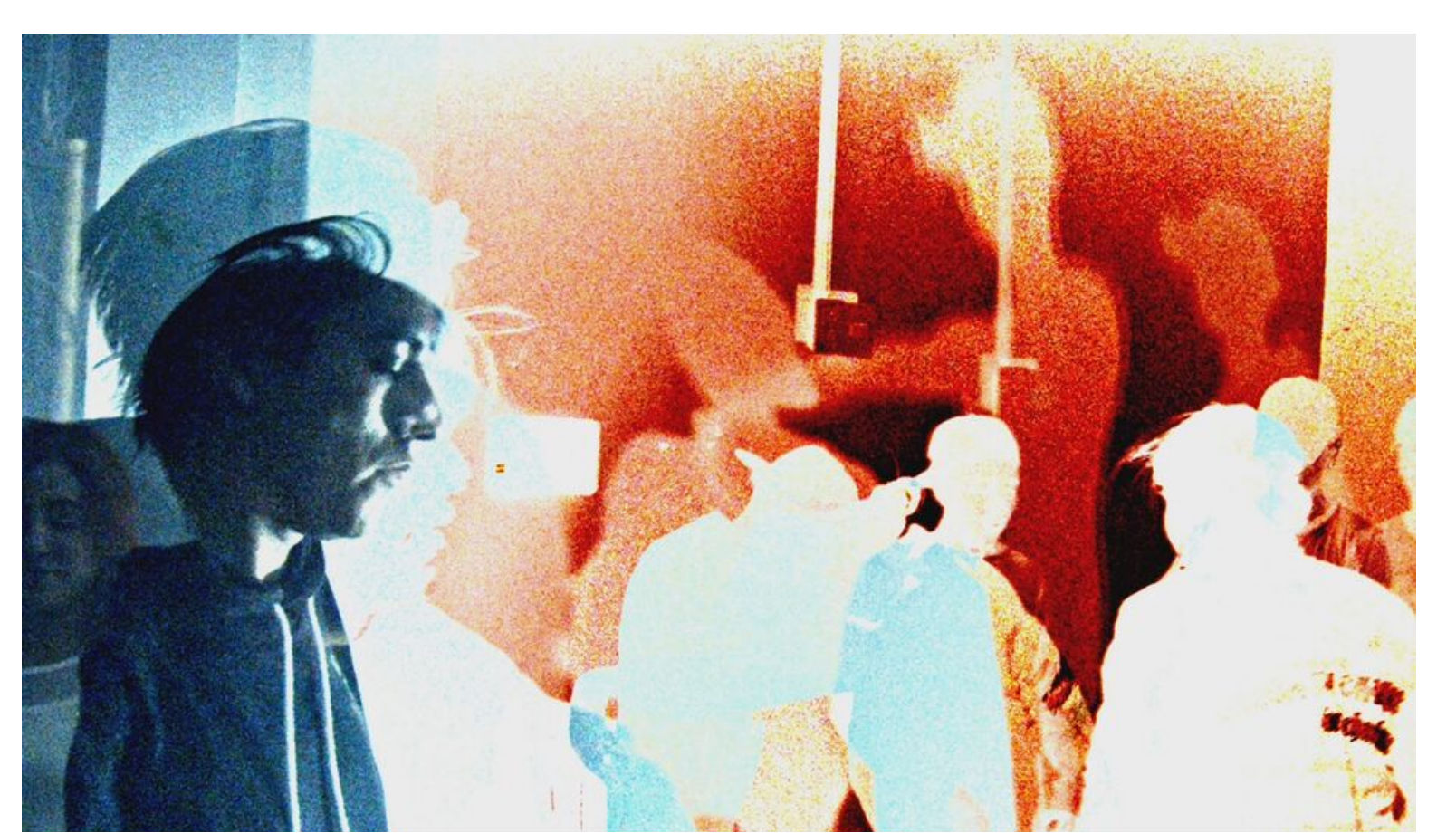
Vietnamese Artist Wins Han Nefkens Foundation's Inaugural Video Art Grant